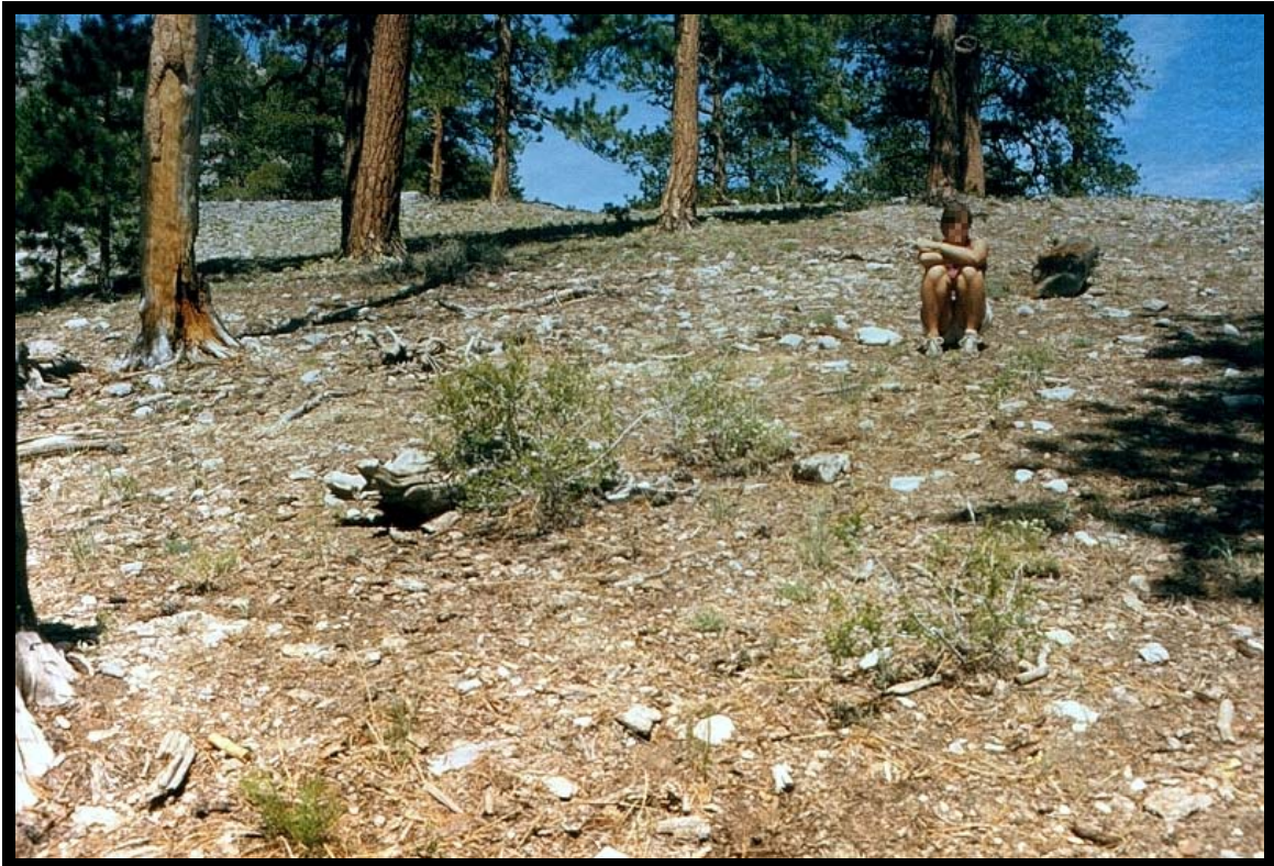
Figure 6. Astragalus oophorus var. clokeyanus growing in a ponderosa pine community at site 7 in Lee Canyon, Springs Mountains.