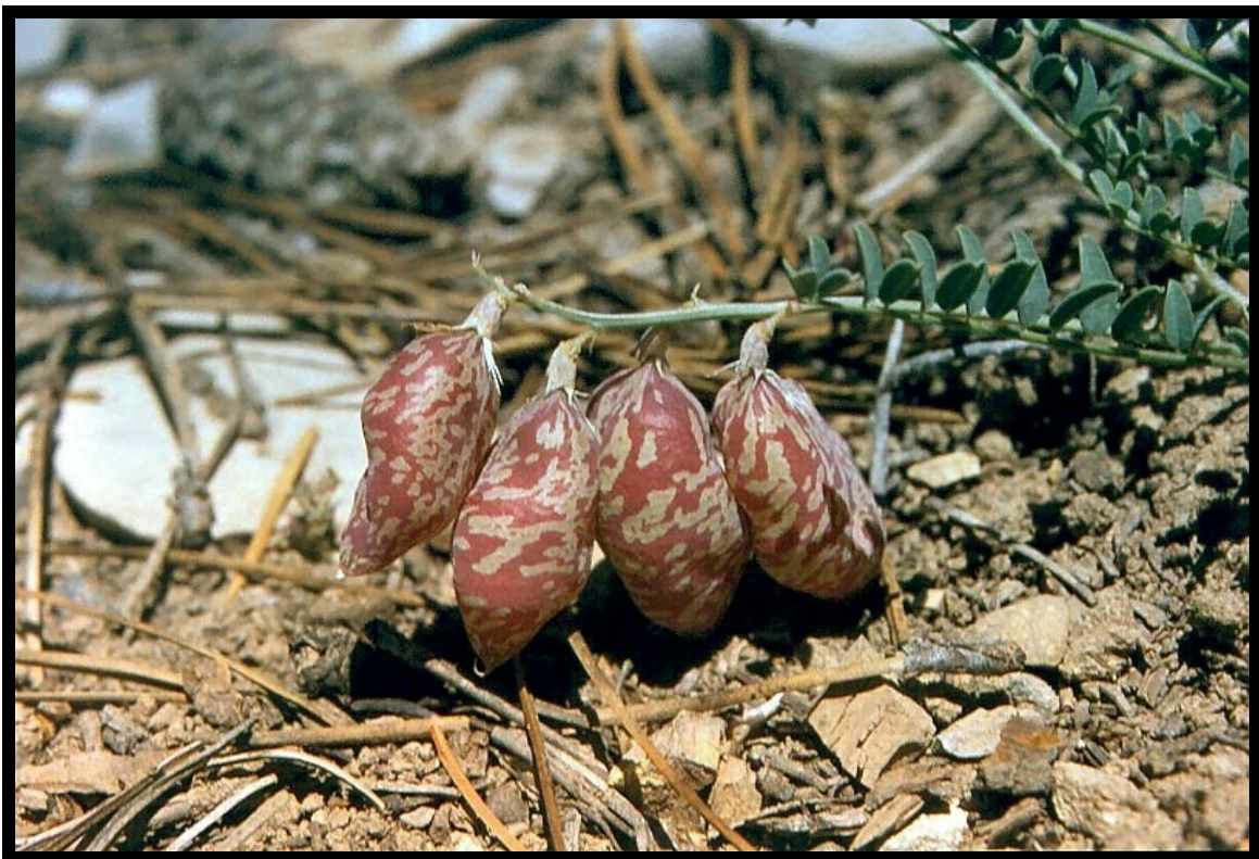
Figure 3. Close-up of fruits of Astragalus oophorus var. clokeyanus at site 7 in Lee Canyon, Spring Mountains.