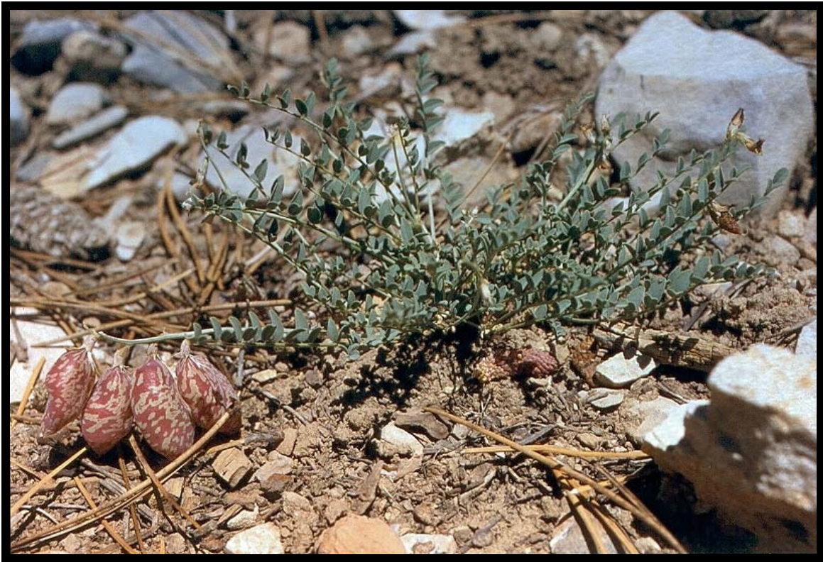
Figure 2. Growth form of Astragalus oophorus var. clokeyanus at site 7 in Lee Canyon, Spring Mountains. See Appendix 1 tables for site descriptions.