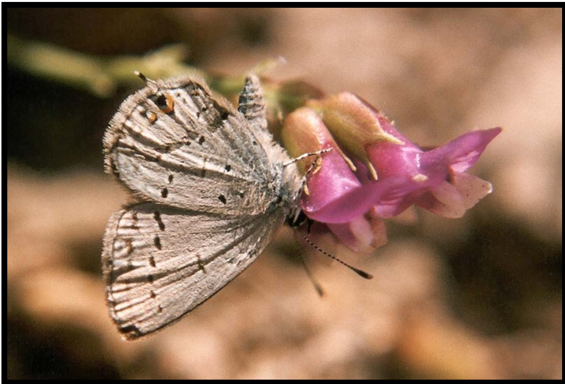
Figure 5. Close-up of Astragalus oophorus var. clokeyanus flowers with unidentified butterfly on a flower at site 15, Indian Springs, Belted Range.