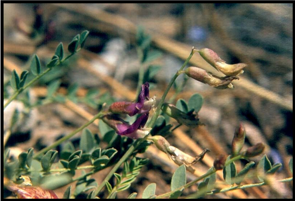
Figure 4. Close-up of flowers of Astragalus oophorus var. clokeyanus at site 7 in Lee Canyon, Spring Mountains.