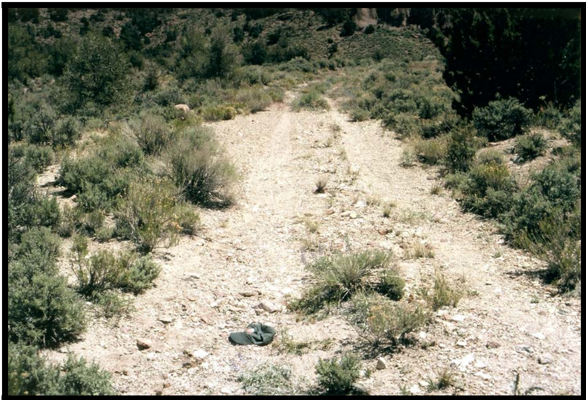
Figure 7. Astragalus oophorus var. clokeyanus growing on a gravel road at site 16, Cliff Spring, Belted Range.